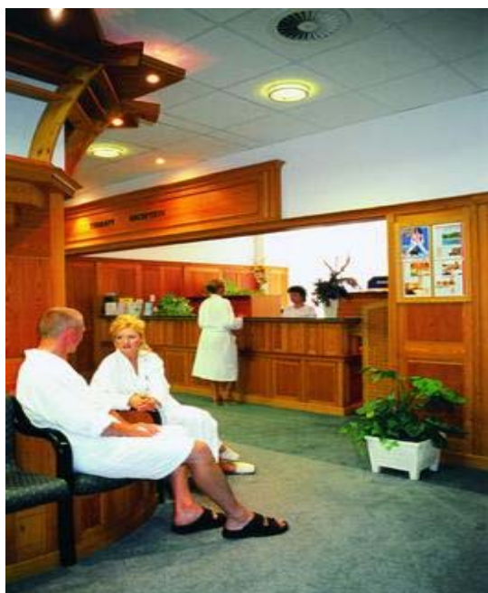
Spa reception Hungry

Working with Nature.... Relaxandpamper.co.uk